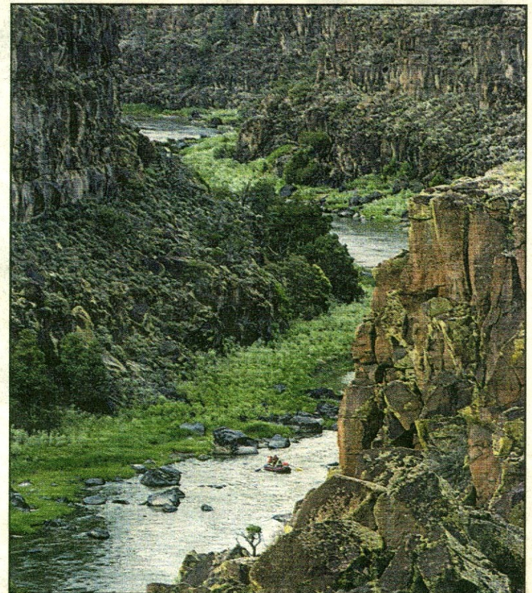
STAYING AFLOAT. The Taos Box in New Mexico offers exciting rafting on the Rio Grande.